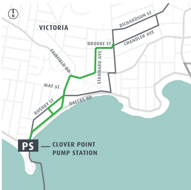
Map of the Trent Forcemain.

The Trent Forcemain is the final component of the Wastewater Treatment Project to be procured and construction is anticipated to begin in early 2020 and take approximately 10 months to complete. The Trent Forcemain will be a 1.9km extension of an existing pipe in the City of Victoria from the intersection of Chandler Ave and St Charles Street to the Clover Point Pump Station. The Trent Forcemain will increase the capacity of the eastern part of the wastewater system.