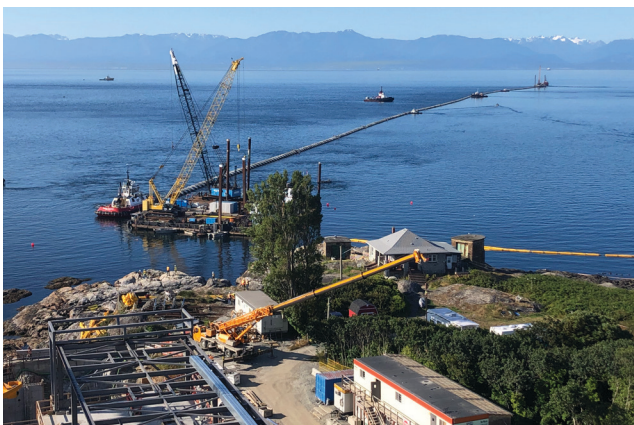
The outfall pipe being installed in July is 2.25m in diameter and 1.92km long.

Construction of the McLoughlin Point Wastewater Treatment Plant in Esquimalt is progressing well. The new ocean outfall was completed in July. Over 95% of concrete has been placed and all concrete is anticipated to be complete by March 2020. Major equipment is being installed on site such as chemical tanks, the primary clarifiers, and secondary filters. Mechanical and electrical work are currently the main activities on site.