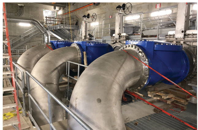
View of the upper pump room in the Clover Point Pump Station.

A new roof has been installed over the expanded Clover Point Pump Station and all the structural concrete is complete. The majority of the work is now inside and is focused on equipment installation. All the large pumps have been installed. In November, work began for pipe installation to connect the Clover Forcemain to the pump station. As well, construction is underway on the public washroom that is being built as part of the public amenities that are being added to the area.