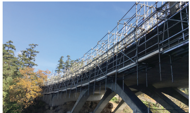
Scaffolding on the Tillicum Bridge to install the RSCL pipe.

Three small pump stations are being built along the Residual Solids Conveyance Line to pump residual solids to the Residuals Treatment Facility. All three are currently under construction with completion anticipated in spring 2020.