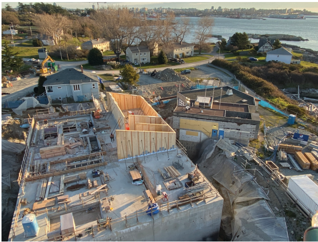
The above-ground timber structure is being constructed at Macaulay Point Pump Station.

With the majority of concrete placed at the Macaulay Point Pump Station, the above-ground structure is currently being constructed. The pumps have been installed and equipment continues to arrive on site each week. The Macaulay Forcemain is nearing completion with over 90% of pipe installed.