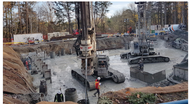
Concrete caisson piles are being installed at the site of the Arbutus Attenuation Tank.

Construction began in Haro Woods for the Arbutus Attenuation Tank, a 5,000m 3 underground concrete tank that will store wastewater during high storm events. Concrete piles are currently being installed around the perimeter of the tank. Once construction is complete, the site will be planted with vegetation appropriate for the woodland setting.