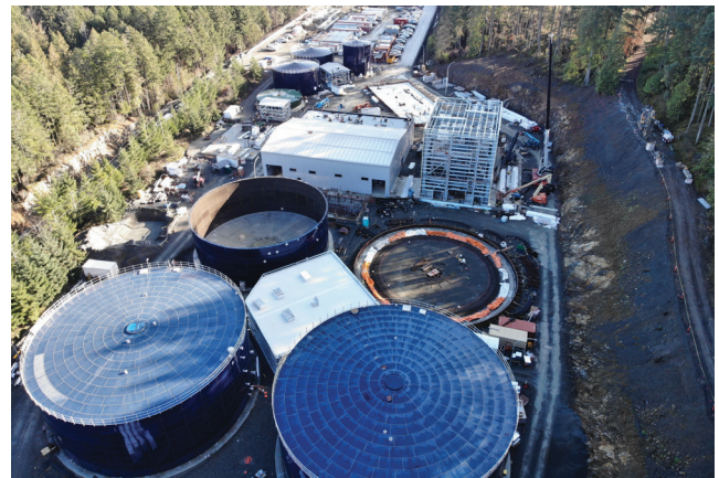
Aerial view of construction at the Residuals Treatment Facility.

Significant progress has been made at the Residuals Treatment Facility. All major equipment has been installed including the heat exchangers, dewatering and dryer equipment. Two of the digesters are complete with work progressing on the remaining tanks. Concrete work is nearing completion and construction of the operations building is underway.