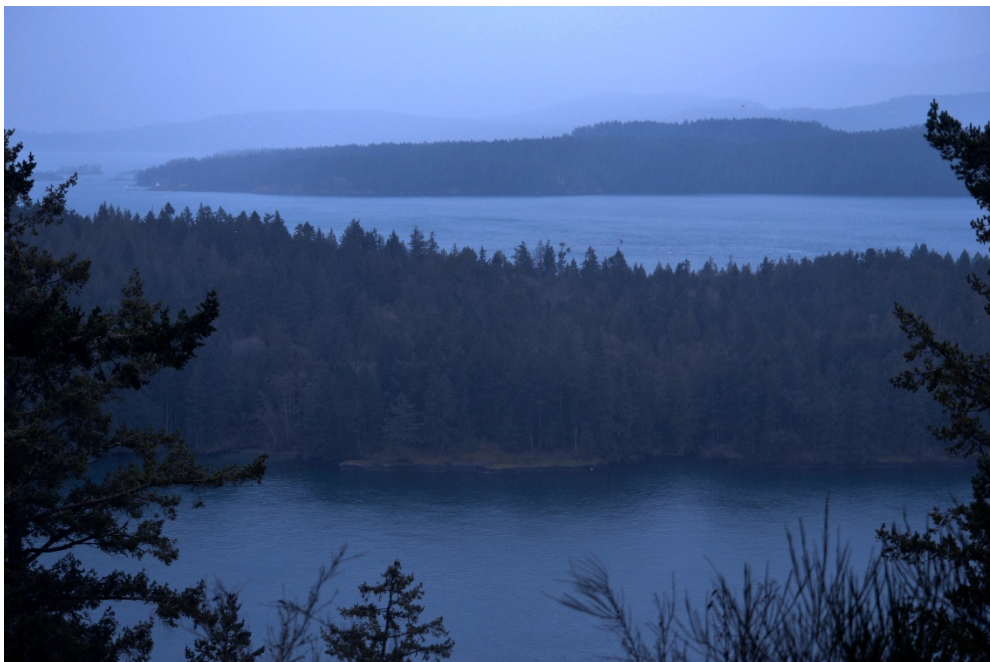
View from Matthews Point Regional Park