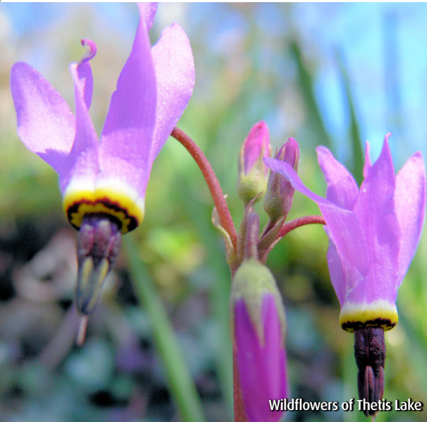
Wildflowers of Thetis Lake