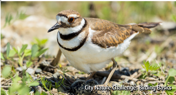
City Nature Challenge: Birding Basics