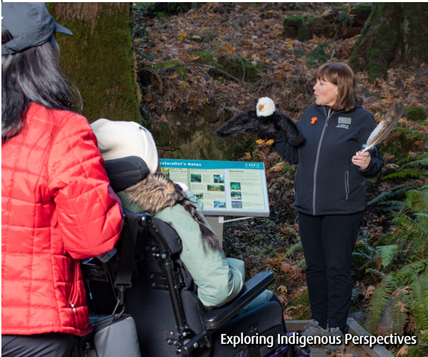
Exploring Indigenous Perspectives