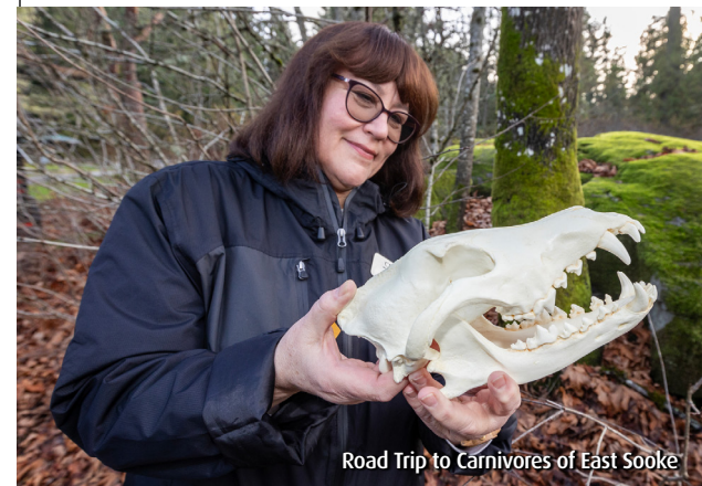
Road Trip to Carnivores of East Sooke