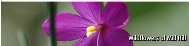
Wildflowers of Mill Hill

Trail Description: 1km; smooth gravel surface; slight incline. Wheelchair accessible.