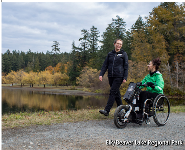
Elk/Beaver Lake Regional Park

We offer programs for a variety of ages and abilities. Brief trail descriptions can be found under each program in the brochure. For more detailed accessibility information, please visit each program's description on our website: www.crd.bc.ca/parks-events .