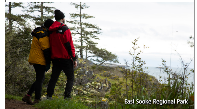
East Sooke Regional Park