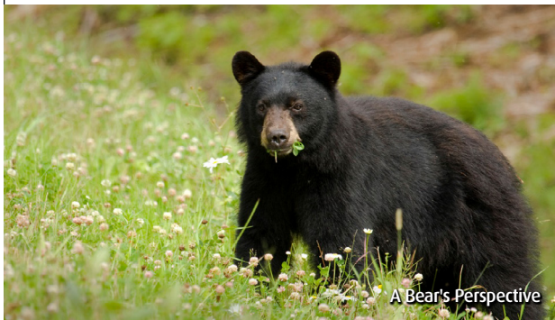
A Bear's Perspective