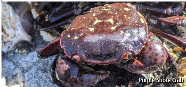
Purple Shore Crab

We can all be caretakers of the forests and beaches, as local First Nations have been for thousands of years. First Peoples believe that all living things should be respected, from insects to eagles, from bees to bears, and from cougars to crabs. As you explore, please travel lightly on these lands and be respectful of the cultures and ecosystems that depend on them.