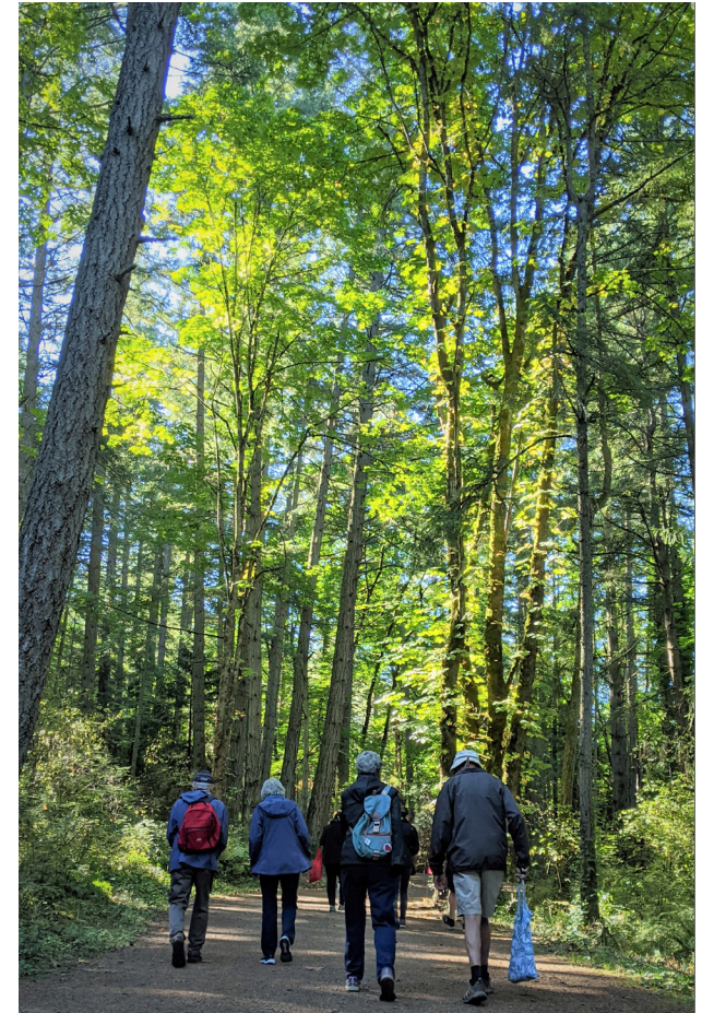
Exploring Indigenous Perspectives Self-guided Walk