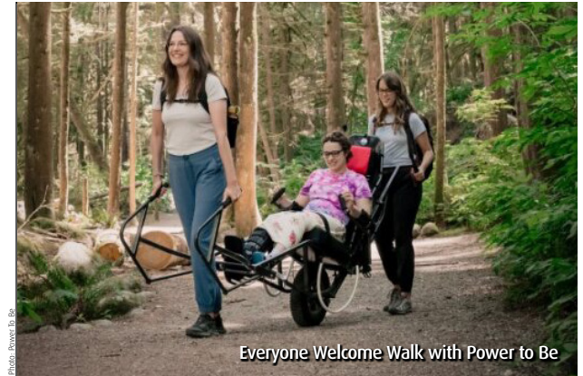
Everyone Welcome Walk with Power to Be