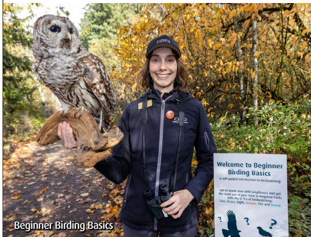
Beginner Birding Basics