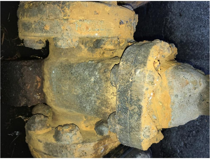
Photograph #10 – Side View: 150 mm Low Level Outlet Control Valve, flanges, nuts & bolts

Photograph #9 – Top View: 150 mm Tee Fitting Tee Body, flanges, Nuts & Bolts