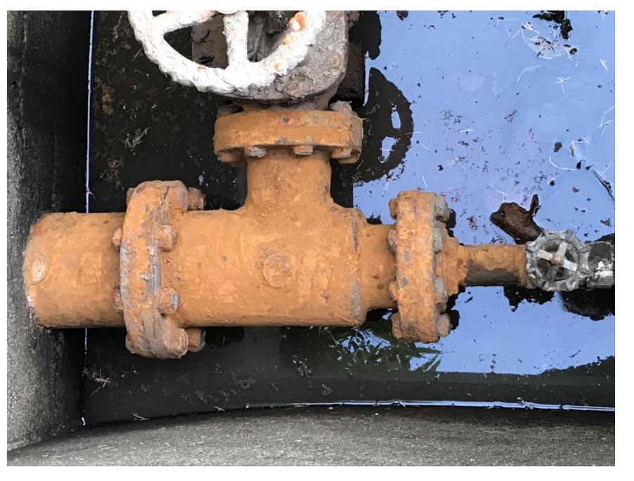
Photograph #4- Top view: Low Level Outlet Fittings Deposit build-up removed