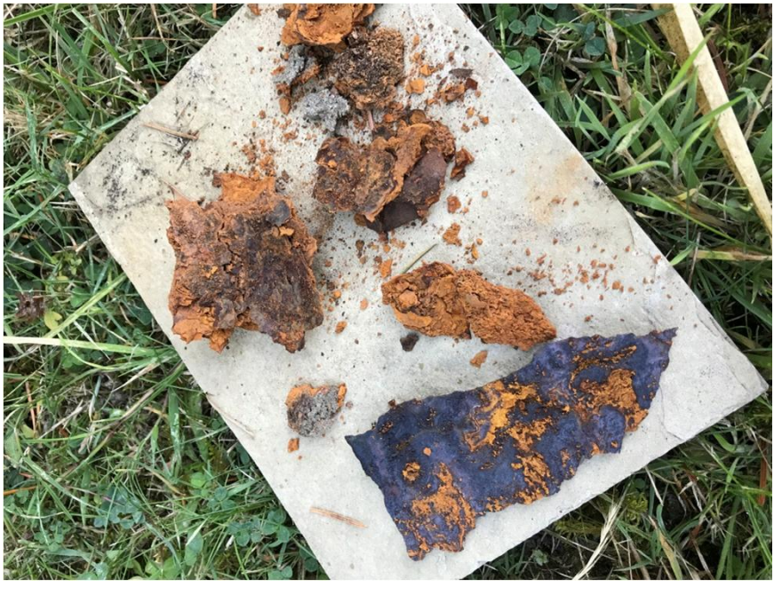
Photograph #6: 50 mm dia. Irrigation feed View of samples collected from pipe spool