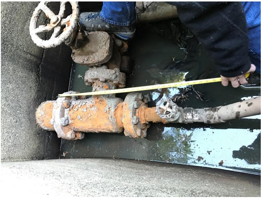
Photograph #2 – Top View: Low Level Outlet Chamber Infrastructure Deposit build-up partially removed