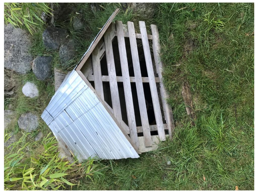
Photograph #1: Low Level Outlet Chamber and Housing Located on downstream face of Gardom Pond Dam