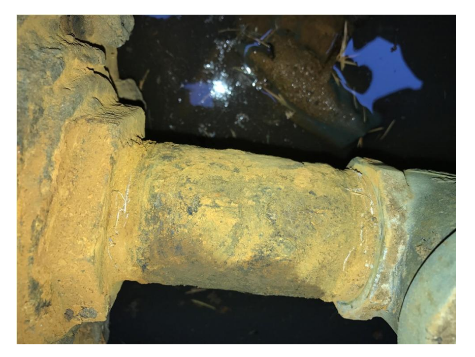
Photograph #7 – Top view: 50 mm dia. Irrigation Feed Deposits and scaling removed Note presences of pipe threads and Teflon tape