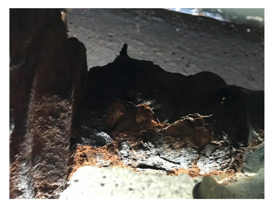
Photograph #5 – Bottom View: 50 mm dia. Irrigation Feed Deposit build up and suspect spalling