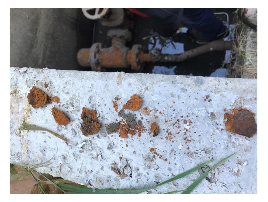
Photograph #3: Deposit Build-Up Typical samples collected from top of fittings & piping