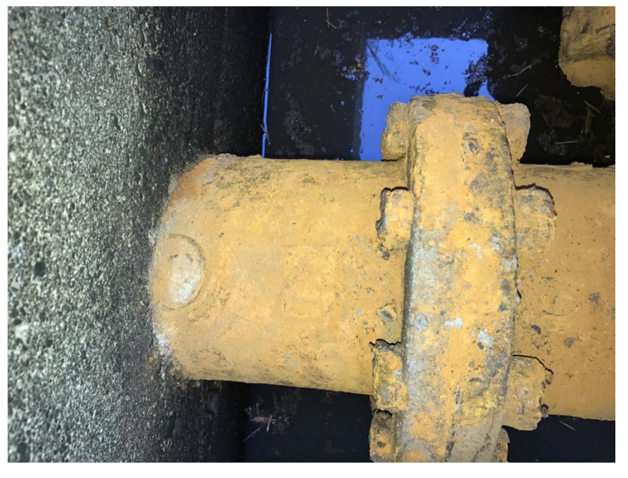
Photograph #8 – Top view: 150 mm Upstream flanges and hardware at concrete chamber wall interface