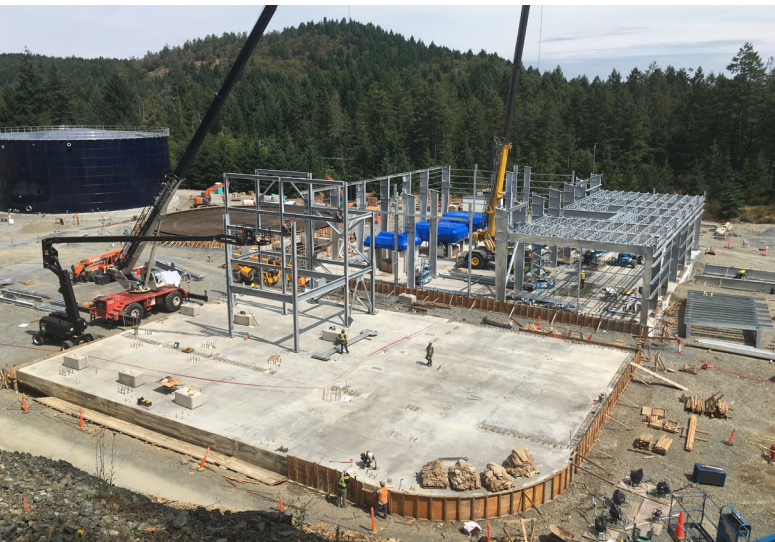
Progress at the Residuals Treatment Facility

The Macaulay Point Pump Station continues to take shape as concrete pouring continues on site. Concrete is anticipated to be complete by the end of the summer and will be followed by construction of the wood structure above ground. Forcemain installation began in June and is progressing down Anson Street. The pipe is 1350mm in diameter and will convey wastewater from the Macaulay Point Pump Station to the McLoughlin Point Wastewater Treatment Plant for treatment.