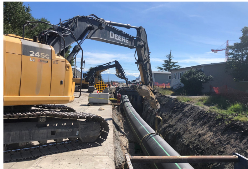
Installation of the Macaulay Forcemain on Anson Street