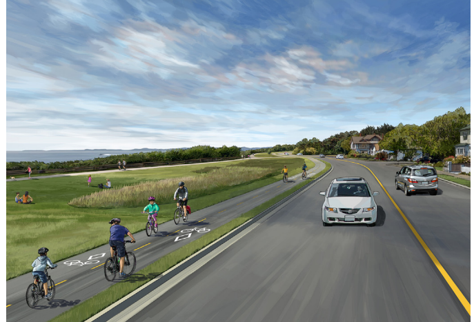
Artist rendering of the cycle path to be constructed

Two viewing plazas with benches, drinking fountain and litter receptacle