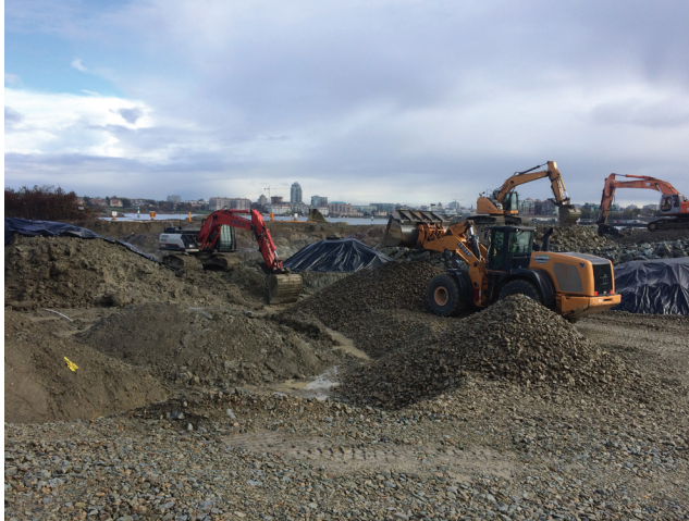
Excavation at McLoughlin Point is underway as crews prepare the site for the construction of the new McLoughlin Point Wastewater Treatment Plant.