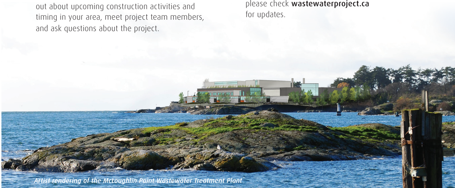
Artist rendering of the McLoughlin Point Wastewater Treatment Plant

Meeting details are being confirmed; please check wastewaterproject.ca for updates.