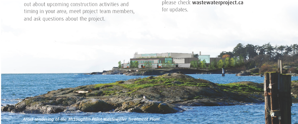
Artist rendering of the McLoughlin Point Wastewater Treatment Plant

Meeting details are being confirmed; please check wastewaterproject.ca for updates.