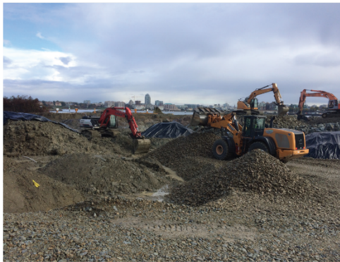
Excavation at McLoughlin Point is underway as crews prepare the site for the construction of the new McLoughlin Point Wastewater Treatment Plant.