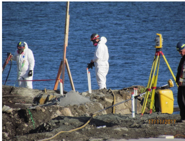
Figure 3- Drilling rebar dowel holes planter wall