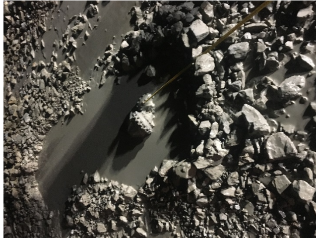
Figure 5 – Pilot hole break through on McLoughlin side