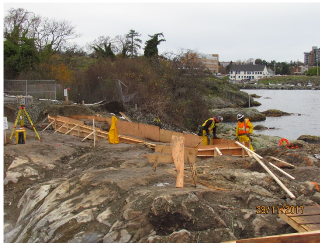
Figure 6 – Install forms for tsunami wall levelling pad