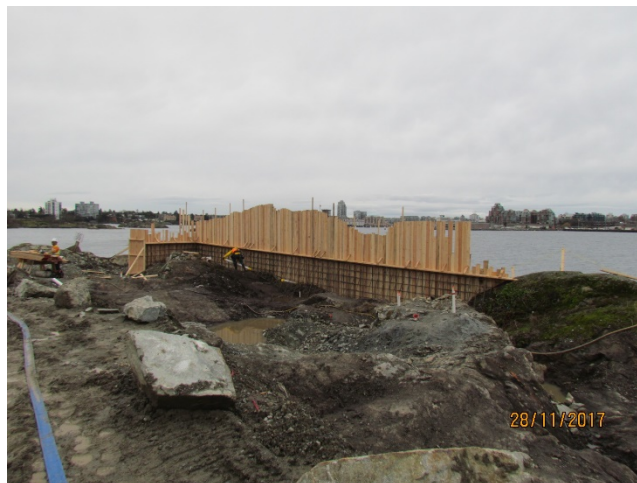
Figure 4 – Rebar installed in planter wall form