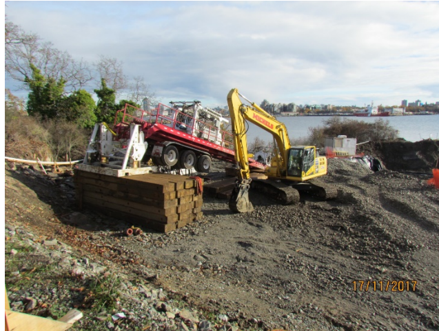
Figure 2 – Setting up HDD drill on McLoughlin side