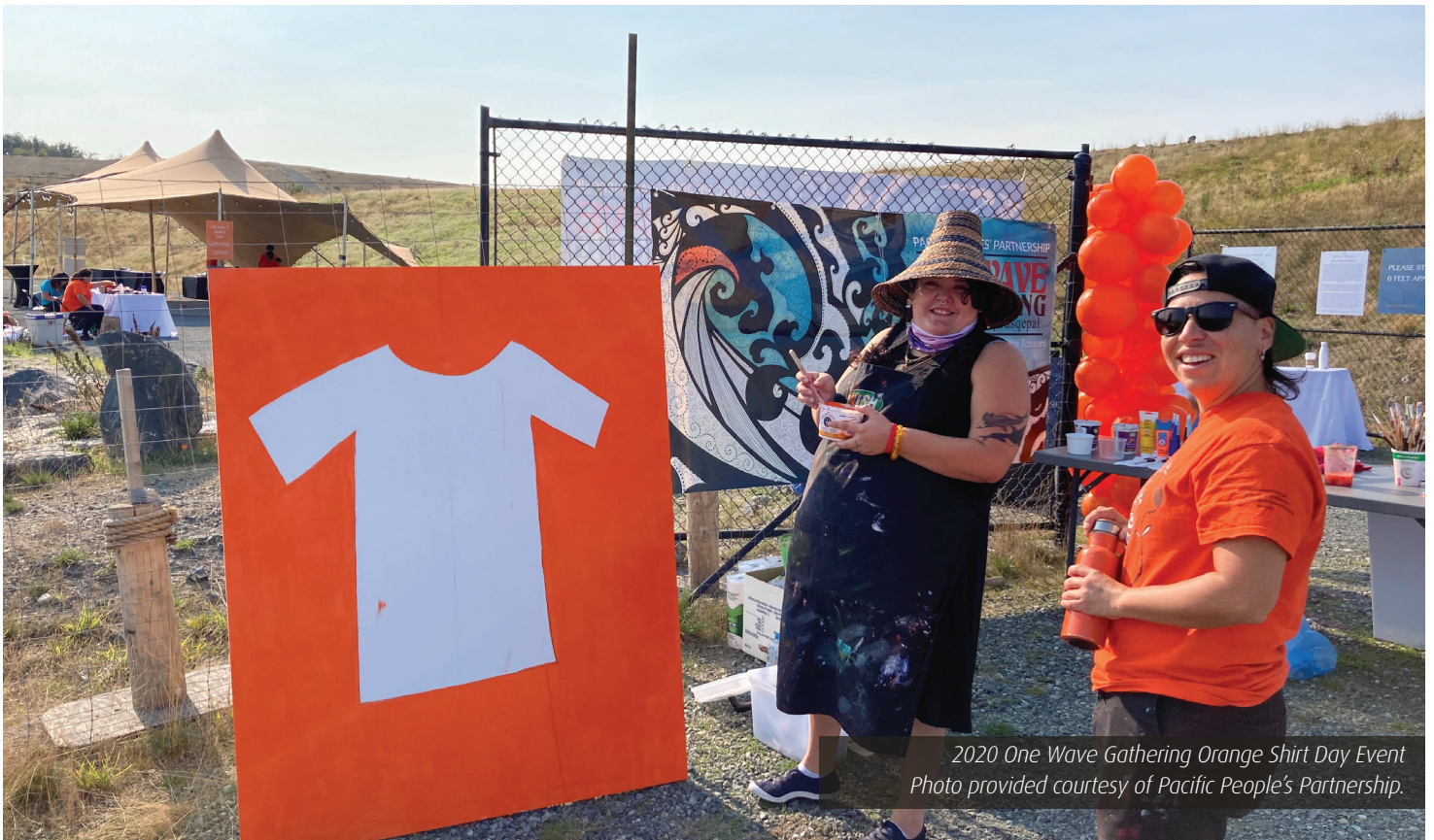
2020 One Wave Gathering Orange Shirt Day Event

Pacific People's Partnership | One Wave Gathering Multi-week gathering providing a welcoming, accessible, and creative space for to engage with topics relevant to Pacific communities, including environmental stewardship, cultural preservation/resurgence, and Indigenous rights. pacificpeoplespartnership.org